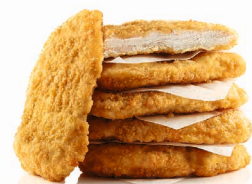
Crunchy Schnitzel Chik'n®