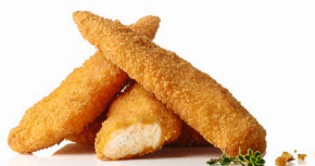
Crispy Chik'n® Fingers