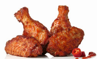
Buffalo Chik'n® Wings extra hot