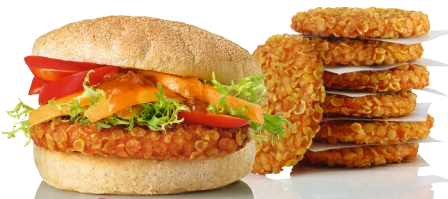
Crunchy Chik'n® Burger