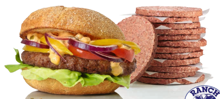
Ranch Master® Hamburger – Halal