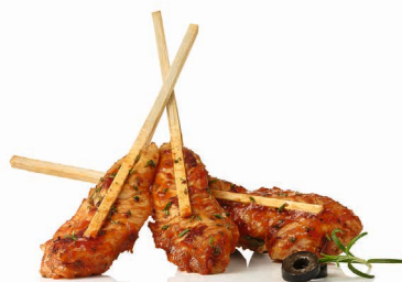
Chik'n® Double Stick Mediterranean