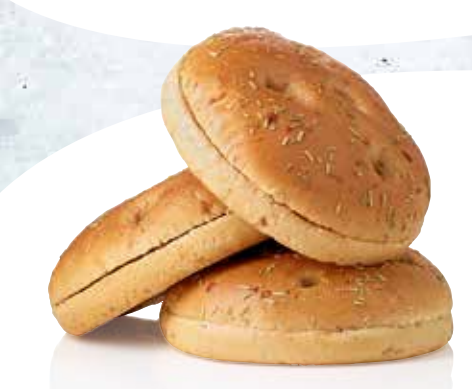
FOCACCIA BURGER BUN NOW VEGAN